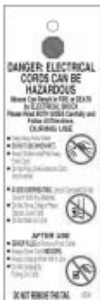
LABEL B BACK